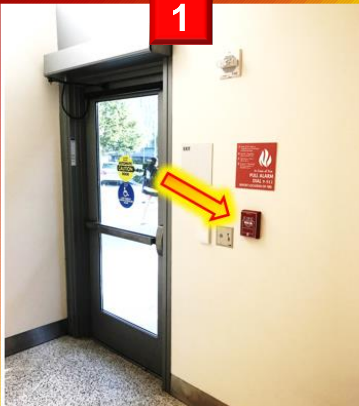
EXIT from LAB outside "Stairwell 7"