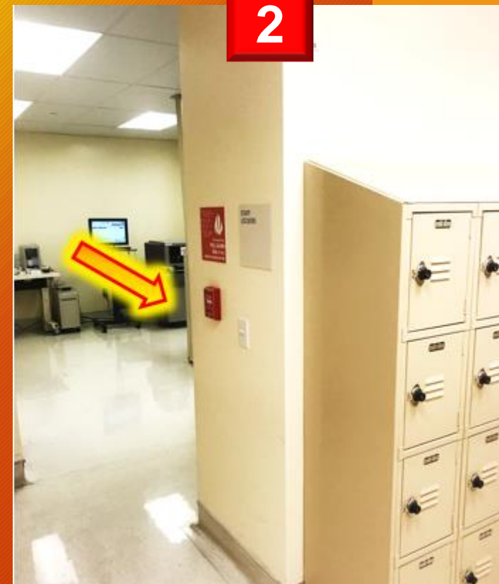
Next to Staff Lockers outside restrooms