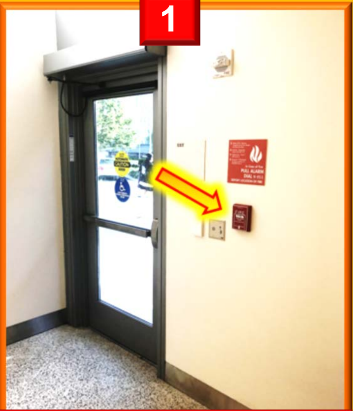
EXIT from LAB outside "Stairwell 7"