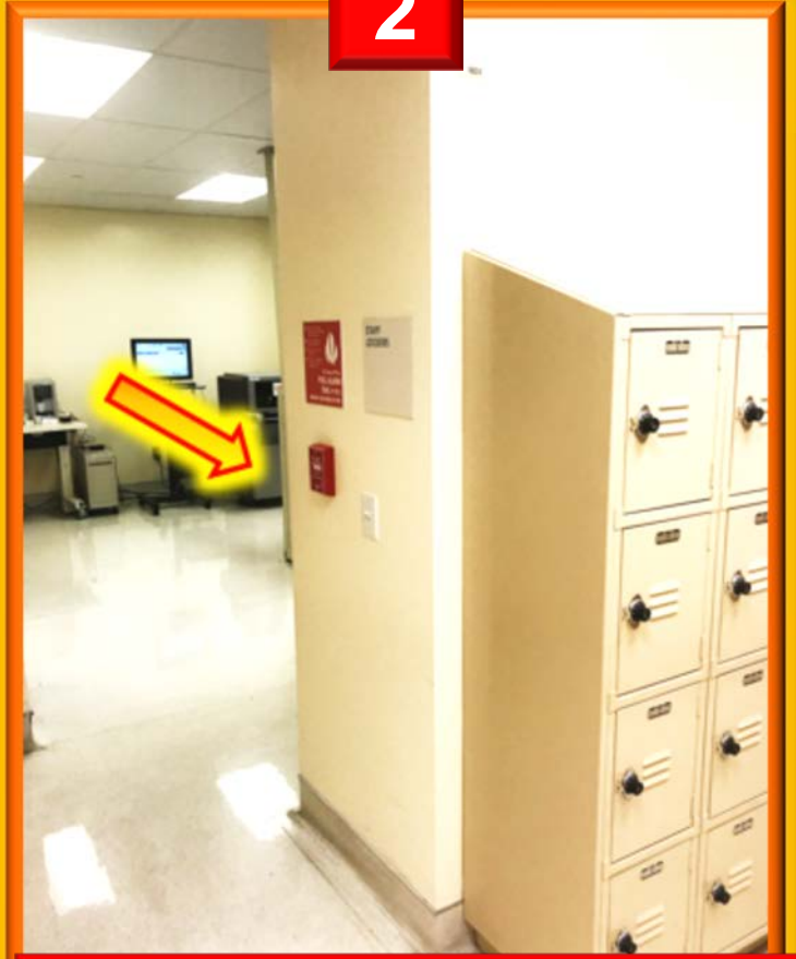
Next to Staff Lockers outside restrooms