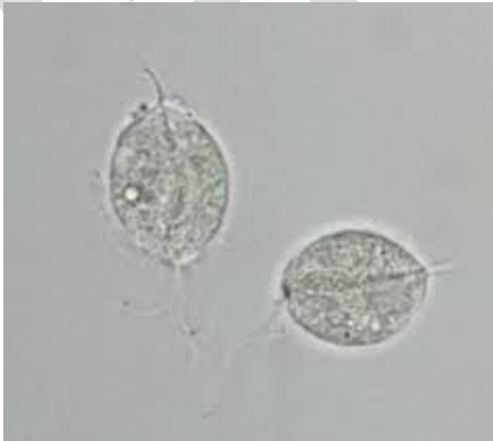
University of California