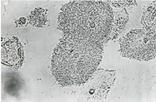
University of California