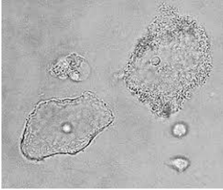
University of California