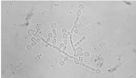
University of California