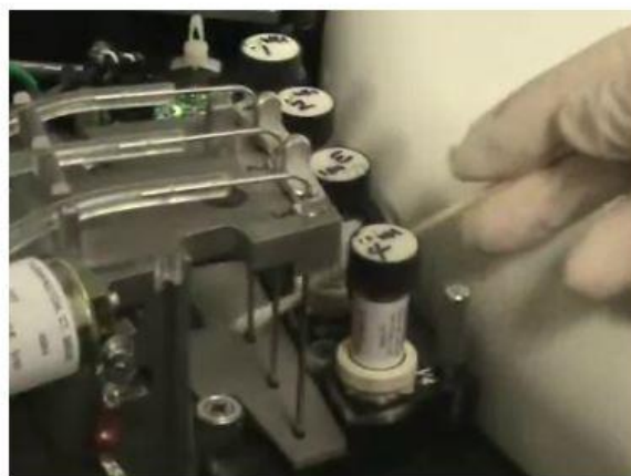
Outside Wash Zone probe cleaning