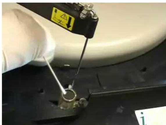
Outside Pipettor Probe Cleaning