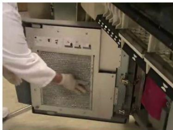
Clean Air Filter #2