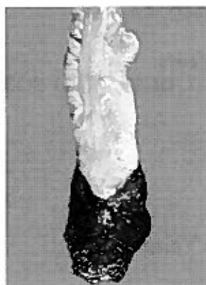
Anterior CRM Inked