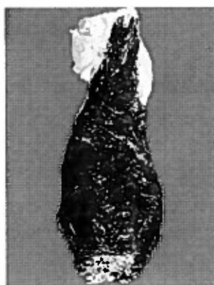
Posterior CRM Inked