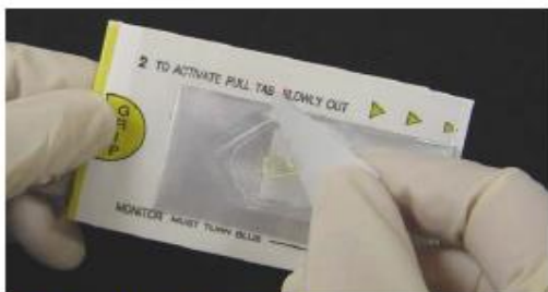
3. Grip where indicated. Lift up silver tab so that white developer pad is visible.