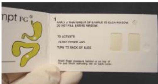
1. Open the card so specimen windows are visible.