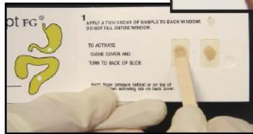
2. Apply a thin smear of specimen to each window. Do not cover entire window (See insert) - Leave an outer periphery of white for contrast. Close card & turn over.