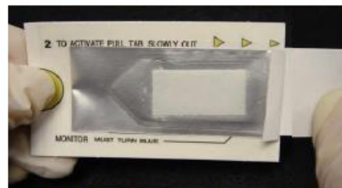
4. Pull silver tab SLOWLY all the way to the right and completely remove it. Developer pad will "flip over" as the tab is pulled.