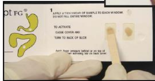
2. Apply a thin smear of specimen to each window. Do not cover entire window (See insert) - Leave an outer periphery of white for contrast. Close cover & turn over.