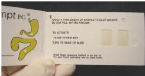
1. Open the card so specimen windows are visible.