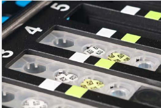
Figure 2: Reagent Placement