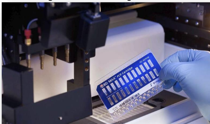
Figure 3: PCR Cartridge Placement