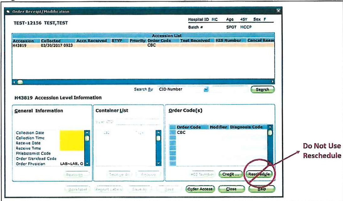
Figure 1: Sunquest Reschedule

Technical Staff Update: All laboratory staff should immediately stop using the Reschedule function in Sunquest (see Figure 1 ) and Collection Manager (see Figure 2 ). This function is not working and poses a significant patient safety risk. If a laboratory test must be rescheduled, the original order must be credited and a new order placed with the new time.