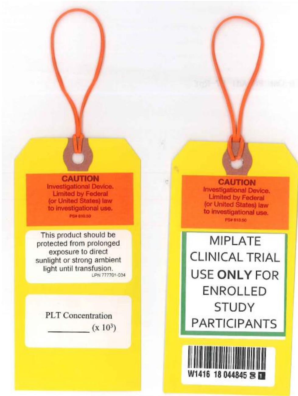
Front of tag

In addition to the label, a bright yellow tie tag will be attached to every Mirasol-treated apheresis platelet. This tag will bear the unit ID, platelet concentration, Investigational statement and instructions to protect product from light. The use of the tag is necessary due to the limited available space on the Product Label. Figure 3 below shows a representation of the tag.