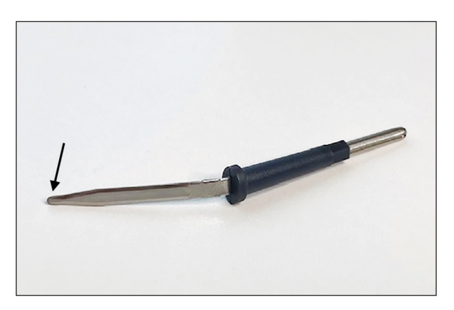
FIGURE 2. A disposable hyfrecator tip (black arrow).