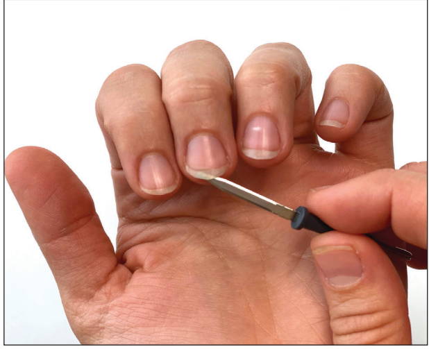
FIGURE 3. The blunt tip of the hyfrecator electrode is used to sweep under the fingernail to painlessly obtain Sarcoptes scabiei to diagnose scabies.

Use of a blunt hyfrecator tip to extract S scabiei from underneath the fingernail plate can be used for efficient diagnosis of scabies. This technique can be implemented