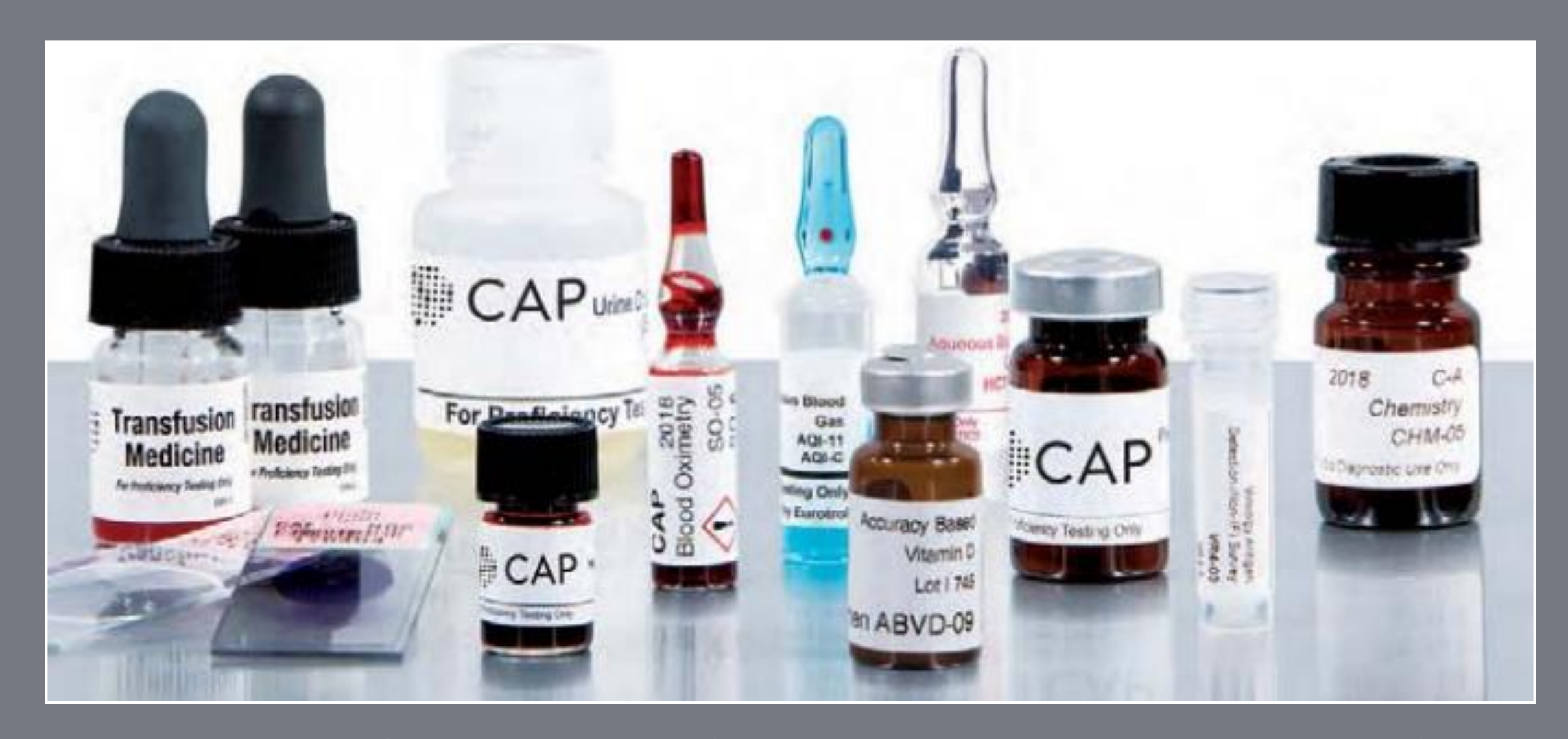
Example of PT Samples - From College of Americans Pathologists (CAP)